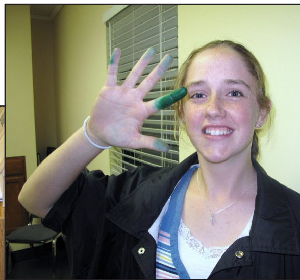
Thanks to Emelie Deslauriers for these pictures of the 30-Hour Famine!