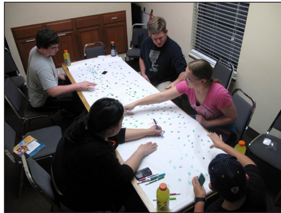
Above, youth and their leaders apply their fingerprints to a poster that declares "One Fingerprint = One Dollar = One Child Fed One Day." Below, youth sharpen pencils in one of the Sunday School classrooms, organizes classroom shelves, and enjoy pizza at the end of the of their 30-hour fast. On the front, one member of the Youth Group writes an encouraging message on one of the brown-bag dinners delivered to nurses at Dublin Methodist Hospital; your pose after delivering the dinners; display their finished poster, and one of the brown-bag dinners bearing a message reminding nurses of God's love and provision as the Bread of Life.