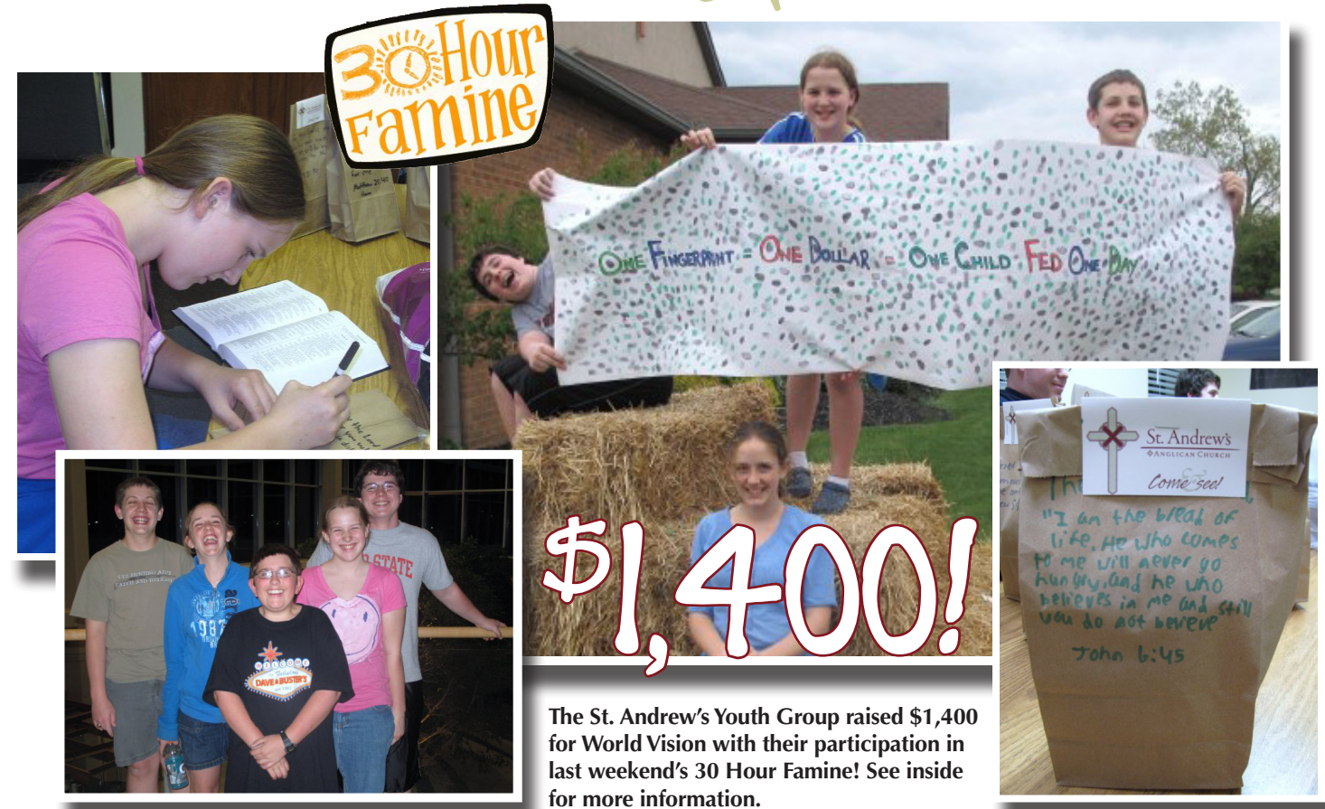
The St. Andrew's Youth Group raised $1,400 for World Vision with their participation in last weekend's 30 Hour Famine! See inside for more information.