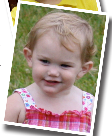
Pictured: The inspiration for Parents Night Out.